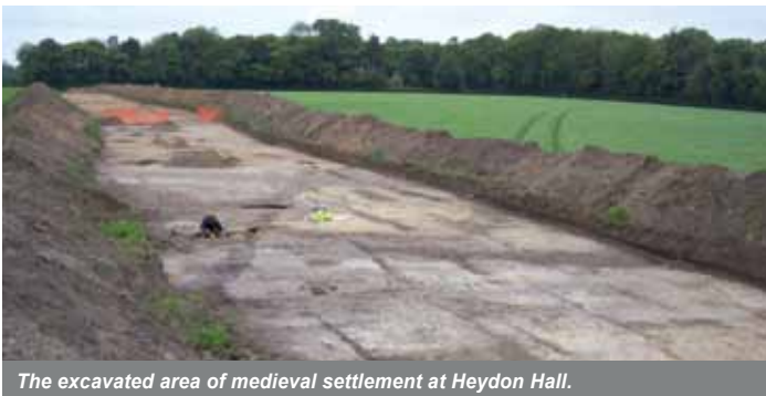
The excavated area of medieval settlement at Heydon Hall.

The excavation revealed a cluster of Iron Age pits, a Roman ditch and a large number of medieval features and artefacts.