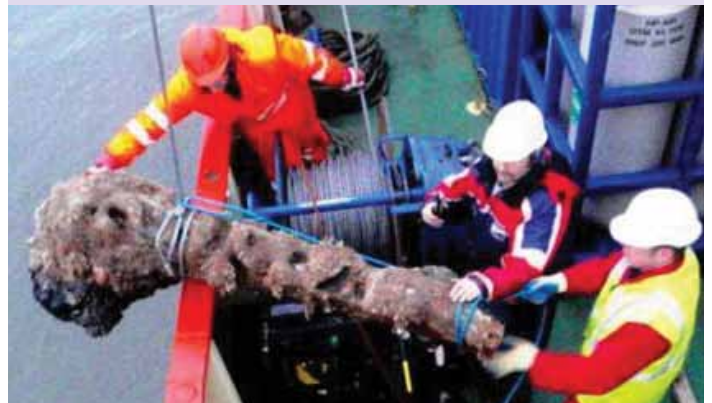
The canon recovered following the unexploded ordnances survey.

Both the canon and the anchor can now be seen on display in The Mo, Sheringham's town museum.