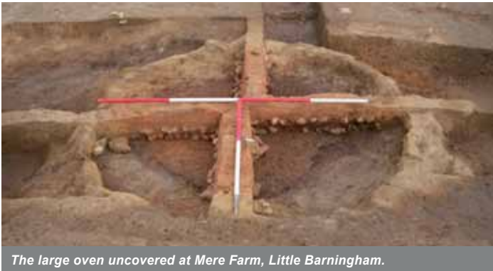
The large oven uncovered at Mere Farm, Little Barningham.

The subsequent excavation revealed a small number of Neolithic, Iron Age, Roman and Early Anglo-Saxon features and artefacts. However, the majority of the excavated features were related to occupation that appeared to start in the 11th century and continued through the medieval period. There were no structural remains, but a significant amount of iron smithing slag was recovered as well as a large oven, perhaps used for baking. This suggests industry related to a small nearby agricultural settlement.