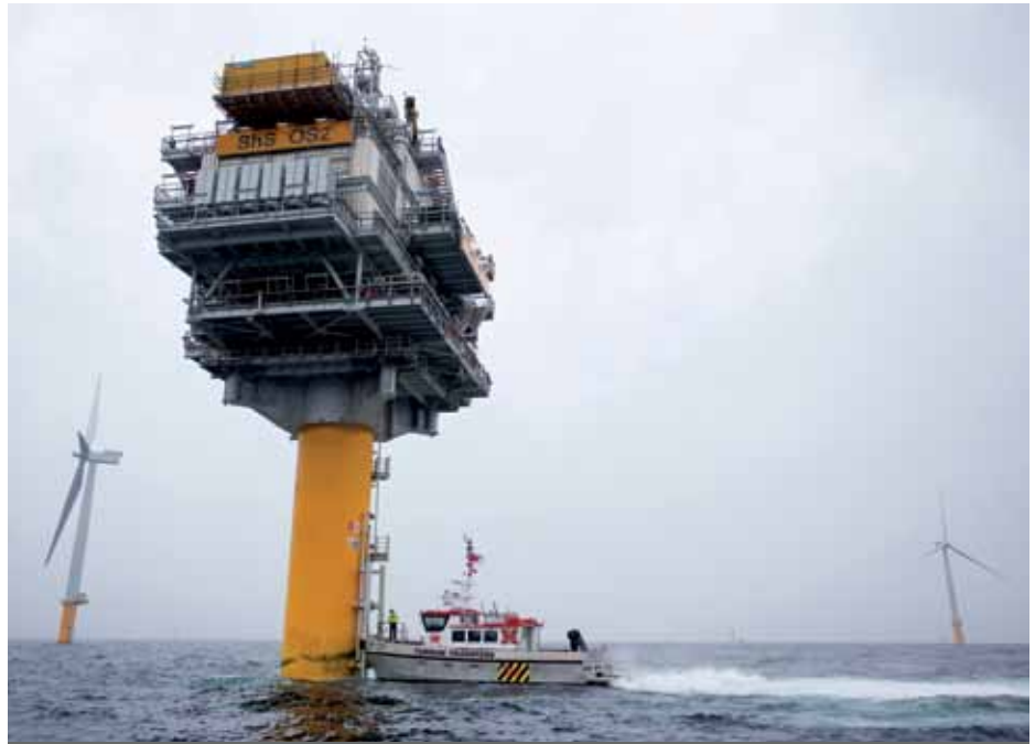
With all the foundations in place, substations positioned and wind turbines being progressively installed, the wind farm is taking shape.