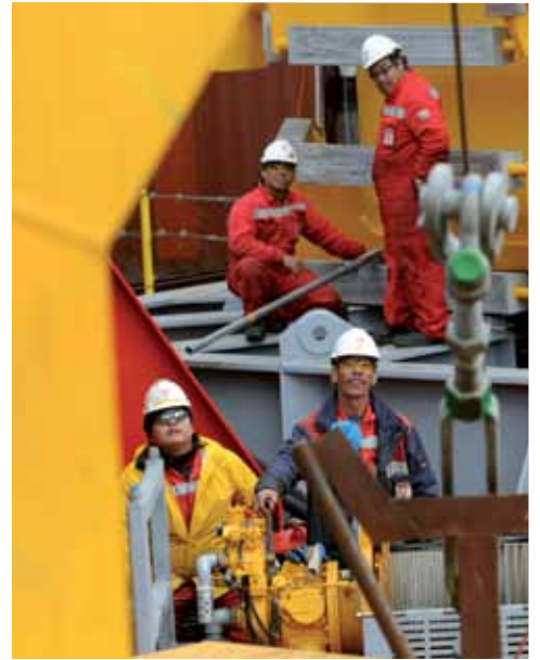
Experts from around the world have been called in to undertake the huge task of building the wind farm.

Each of the three phases of the Sheringham Shoal Offshore Wind Farm – development, construction and operation – have distinct requirements in terms of tasks and people with the skills to carry them out.