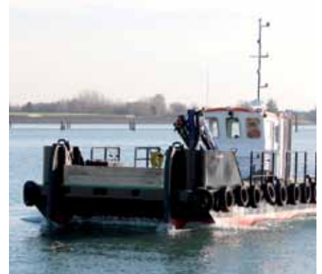
The Frank-T is employed daily to transport items to the outer harbour.