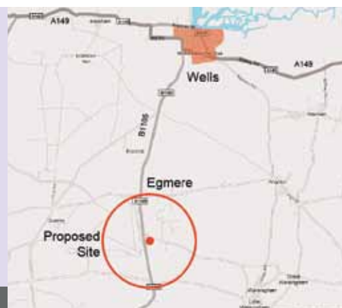
Map of the new operations base at Egmere.

A contractor for the construction of the base is now being sought by Norwich-based architects LSI, with work due to start on site this October. The expected completion date is mid 2012.