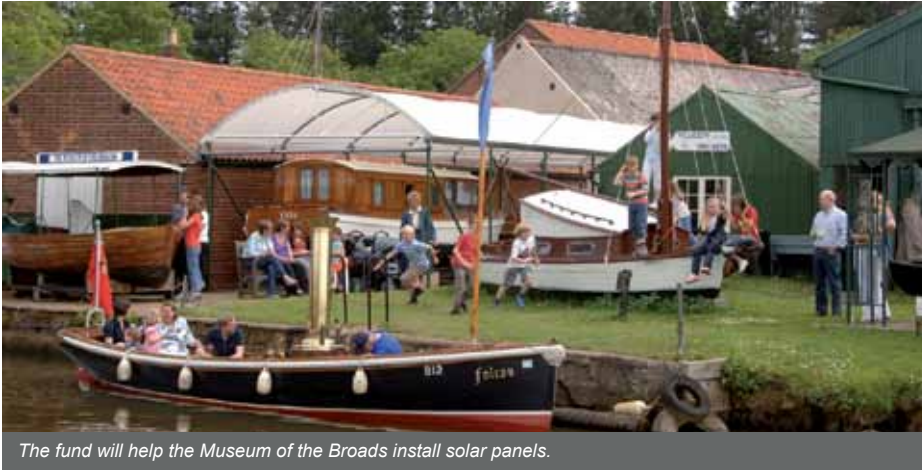
The fund will help the Museum of the Broads install solar panels.

A how-to-go-green web guide and the installation of photovoltaic solar panels are just two of the projects to get the go ahead following the most recent award of funds by the Sheringham Shoal Community Fund.