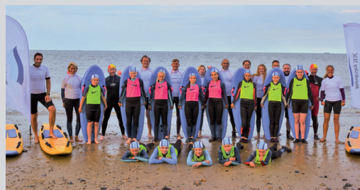
Members of the Mundesley SLSC with their new equipment

Over the last few years sufficient funds have been raised to acquire two lifeboats, a purpose-designed launch vehicle, and a search and rescue quad bike. During 2018 a £20,000 grant from the Sheringham Shoal Community Fund enabled the lifeboat shed to be renovated and its operations room and training facilities to be extended and improved ●