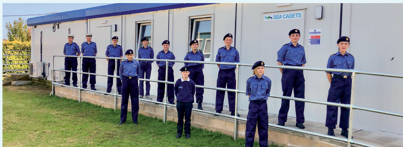
A grant from the Sheringham Shoal Community Fund has supported a 'new home' for Wells Sea Cadets.

A wide range of organisations have successfully applied for grants from the Sheringham Shoal Community Fund. The case studies overleaf give an insight into some of the numerous projects which have been able to proceed due to contributions from the Fund.