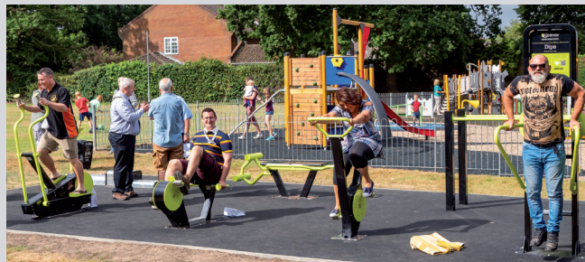
The outdoor eco-gym developed by North Walsham Play

With the assistance of a grant from the Sheringham Shoal Community Fund, Norfolk's first outdoor eco-gym has opened in the Memorial Park in North Walsham.