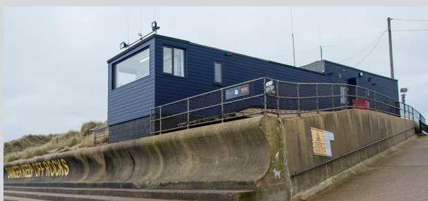
The Sea Palling lifeboat shed following renovations

"I am passionate about encouraging young people to use and enjoy the sea and its beaches as a playground, and surf life saving teaches them how to do so in a safe and responsible manner" ●